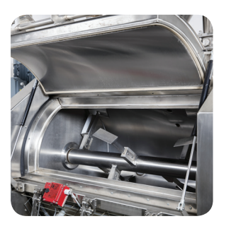
The angled-blade mixer has moisture sensors, temperature measurement technology as well as nozzles for applying steam and liquids.