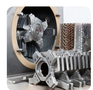
With hammer widths of 3 or 10 particle sizes below 1 mm for corresponding sieve widths.