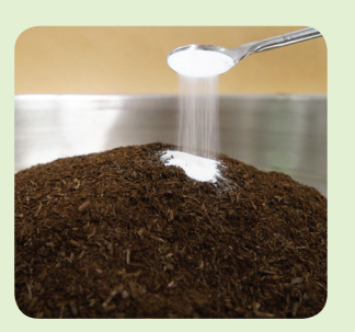
The addition of pressing aids or additives to the raw material improves the mechanical properties of densified biomass and influences combustion properties positively.

During conditioning the material is being prepared for densification (pelletizing) and further adjusted depending on the intended conversion path (combustion, gasification). The two main approaches are blending with additives (e.g. for improving thermo-chemical conversion or stability of the pellets) and adjustment of water content. The current focus of our research, for achieving optimal fuel properties, is on: biomass dependent choice of additives, appropriate dosage and optimal form of application.