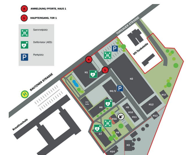
Site Map of the DBFZ Grounds