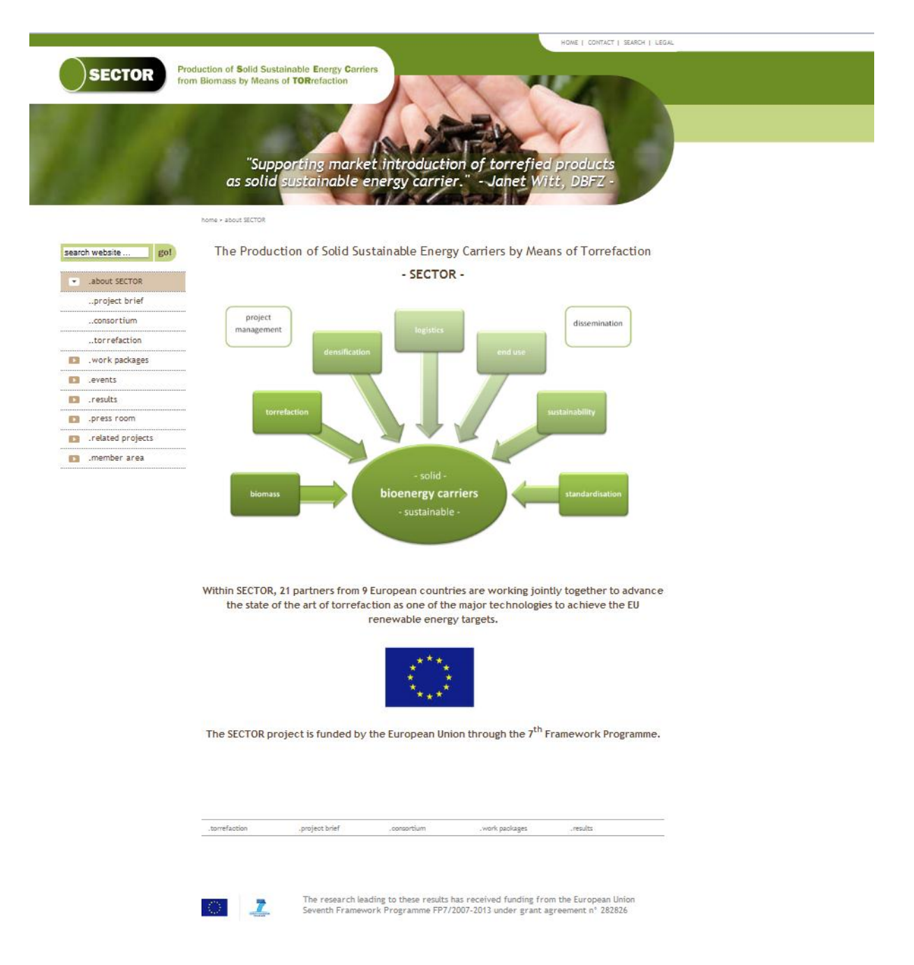
Fig. 1: Screenshot of SECTOR website (home)

The website navigation is structured into 7 sections informing about torrefaction, the consortium, the funding, the results and the dissemination activities such as meetings, conference participation and publications. The website also informs about similar projects with or without funding by the EC.